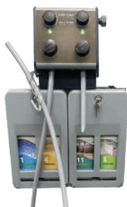
QUICK LOAD LOCKING CABINET