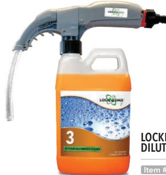
LOCKNLOAD JR DILUTION UNIT