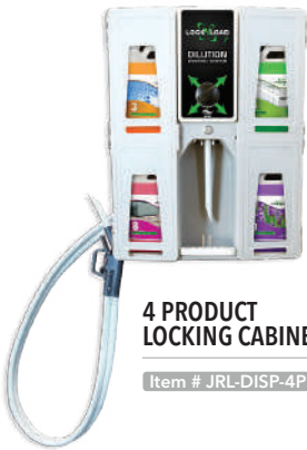
4 PRODUCT LOCKING CABINET