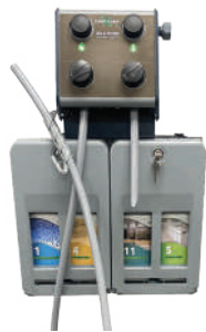
QUICK LOAD LOCKING CABINET