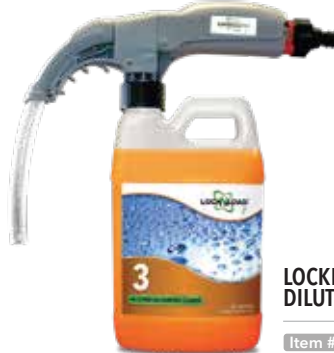
LOCKNLOAD JR DILUTION UNIT