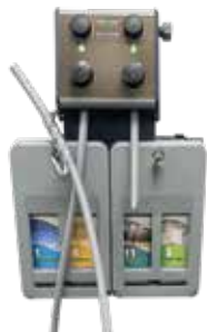
QUICK LOAD LOCKING CABINET