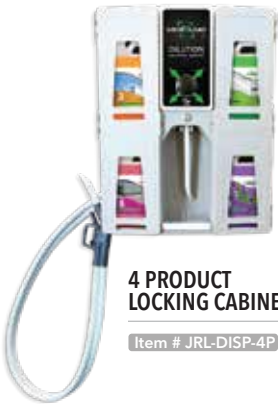
4 PRODUCT LOCKING CABINET